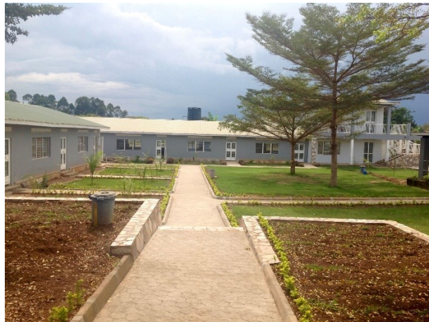
Africa Reformation Theological Seminary – Kampala, Uganda