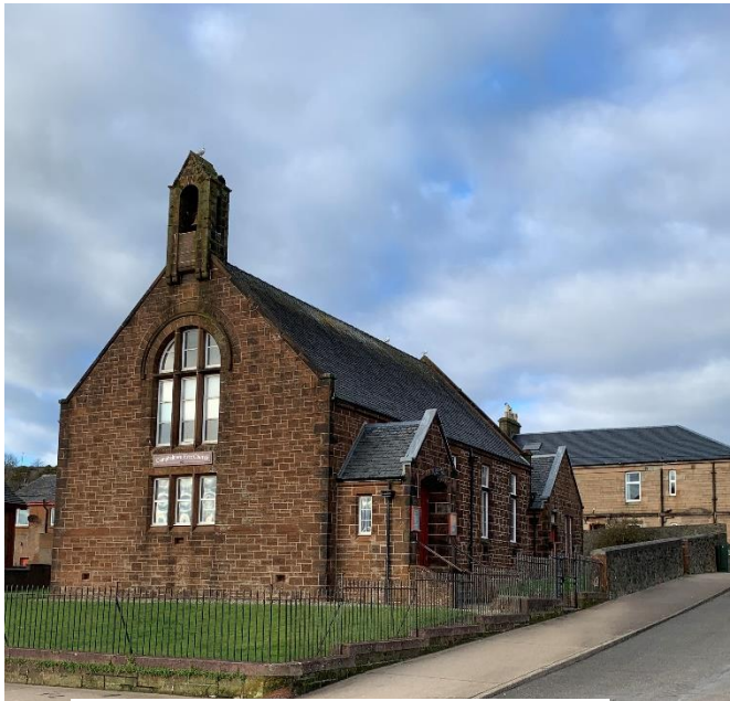
Campbeltown Free Church, Scotland

It is good to be back home after ten weeks overseas. Thank you for holding up these past weeks in prayer. We started with being involved at Campbeltown Free Church in the Kintyre Peninsula of Scotland. It was a wonderful opportunity for ministry, and what a blessed time we had in Christian fellowship! While there, we also managed to complete work that needed to be done at the National Library etc. in Edinburgh for