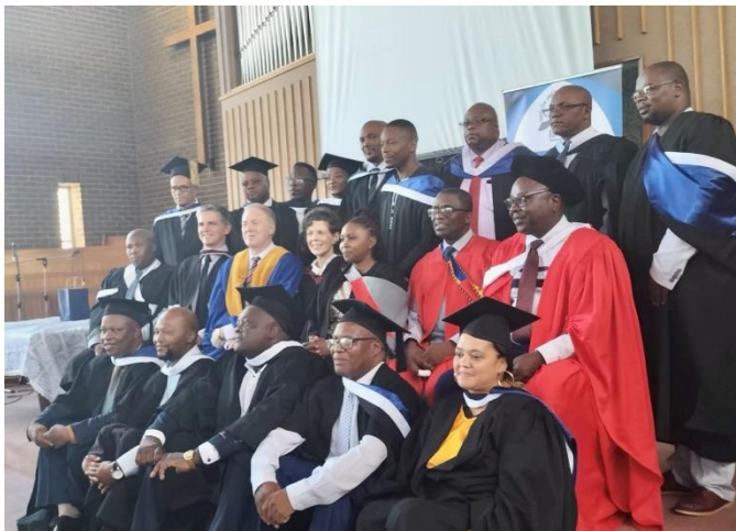
AMS (diploma) graduates only, with graduation participants

held outside with food and refreshments. Truly it was a time of rejoicing in the Lord's goodness. Many current students also attended the graduation exercises. Currently Dumisani has between 60 and 70 students.