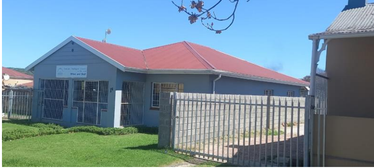
Dumisani Office Building with new roof

Dumisani is now 44 years old. For the 40 th anniversary (2019) a full upgrade and redevelopment of the campus was completed to prepare Dumisani for the next ten years of ministry and also to help with the accreditation process. Many major changes were accomplished at that time, including a new second lecture hall, new toilet facilities, an improved and extended parking area, security updates, new floors in several buildings with all rot removed, concrete poured, and tile flooring installed. At that time all of the roofs were repaired but with the plan that over the next ten years two buildings were identified needing new roofs.