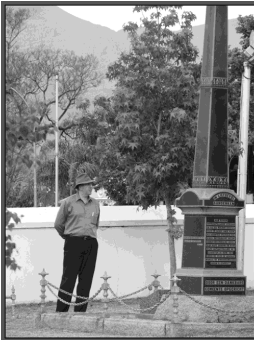
Andrew Murray’s grave, Wellington, South Africa